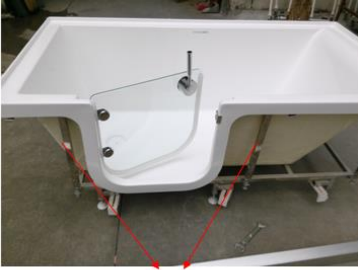
Stainless steel poles